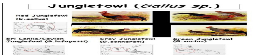
Figure 3 Distribution of the four wild chicken species (after Han, 2014).