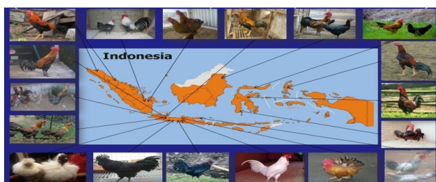
Figure 1 18 most popular breeds of native chickens in Indonesia.

Native chickens are historically the result of years of domestication of four wild chicken species: Red Junglefowl ( Gallus gallus ); Grey Junglefowl ( Gallus soneratti ); Green Junglefowl ( Gallus varius ); and Ceylon Junglefowl ( Gallus lavayetti ) (Figure 3; Jianlin, 2014). The Red Junglefowl, which is believed to be the progenitor of the domesticated chicken, has its widest distribution in east Asia, from Pakistan through China, Eastern India, Burma, most of Indo-China, and on the islands of Sumatra, Java and Bali (Han, 2014). Existing poultry varieties comprise of a wide range of breeds and strains that have evolved in the process of domestication and breeding. Breeding of poultry for commercial purposes using highly efficient selection programmes has resulted in a few highly specialized lines dominating today's world market (e.g. see Table 1).